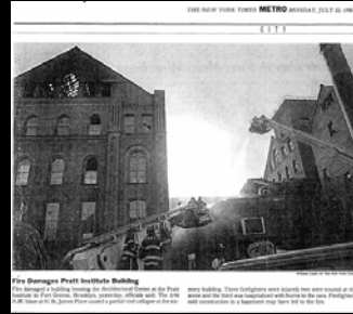
1996 Fire destroys Central Wing, damages rest