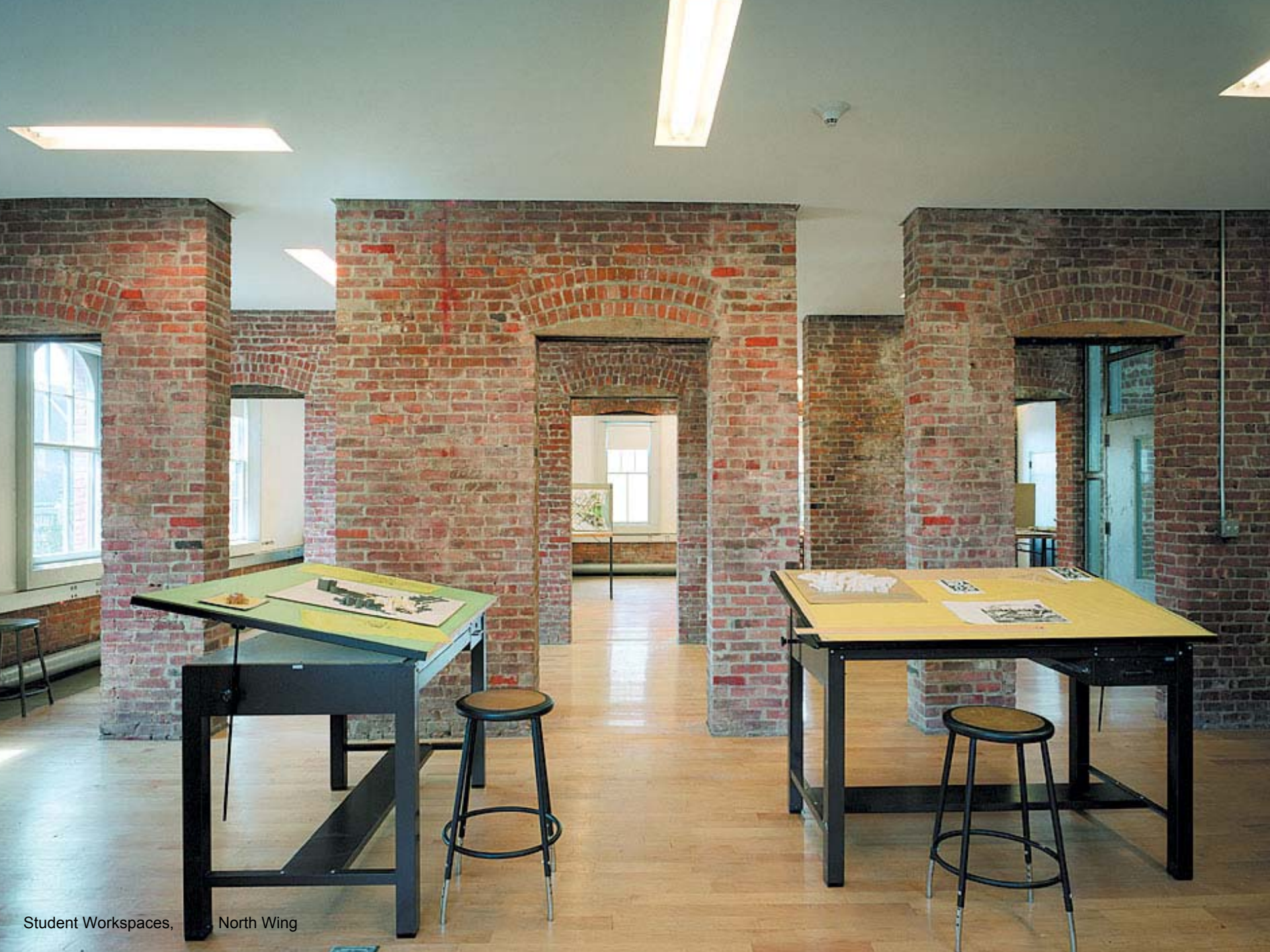
Student Workspaces, North Wing