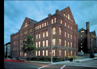
1999 North Wing in use