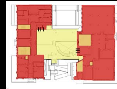
2005 Central Wing completed