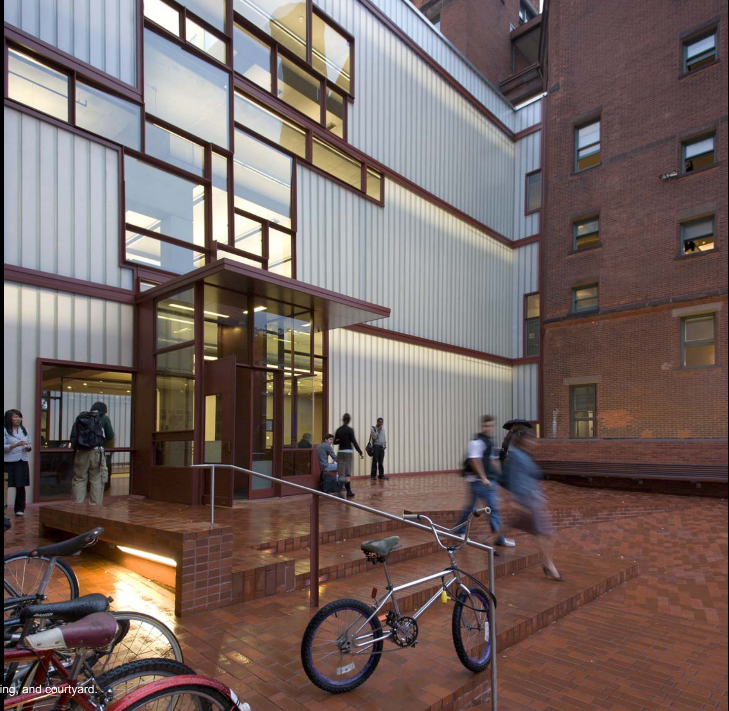
Central Wing, South Wing, and courtyard.