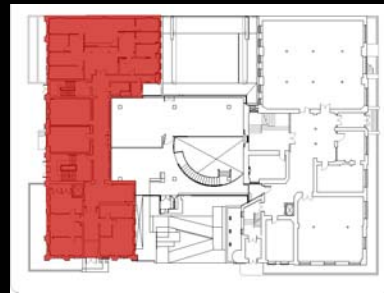
1999 North Wing completed