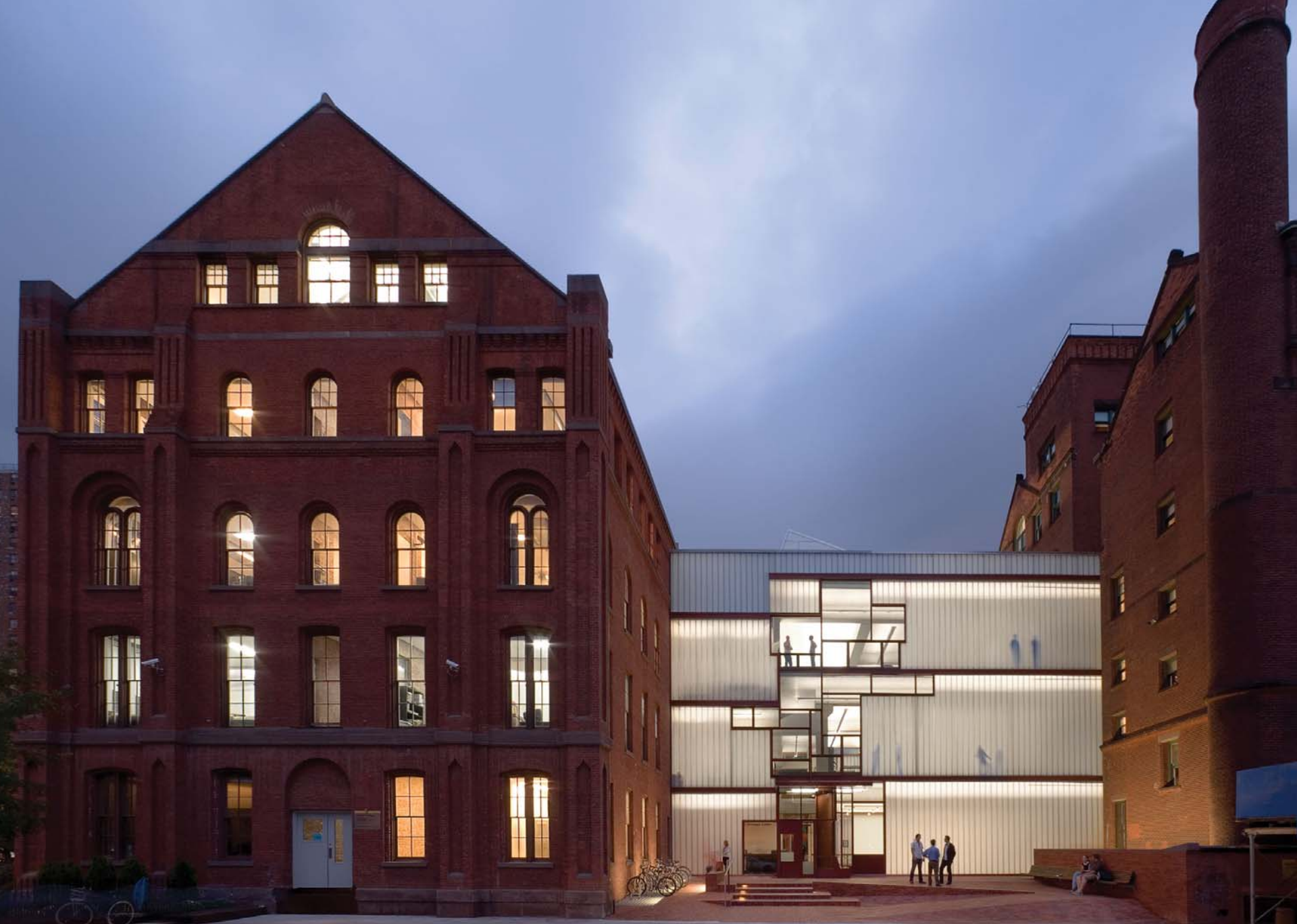
2005 Pratt Institute School of Architecture, Higgins Hall. From left to right: North Wing, Central Wing, South Wing