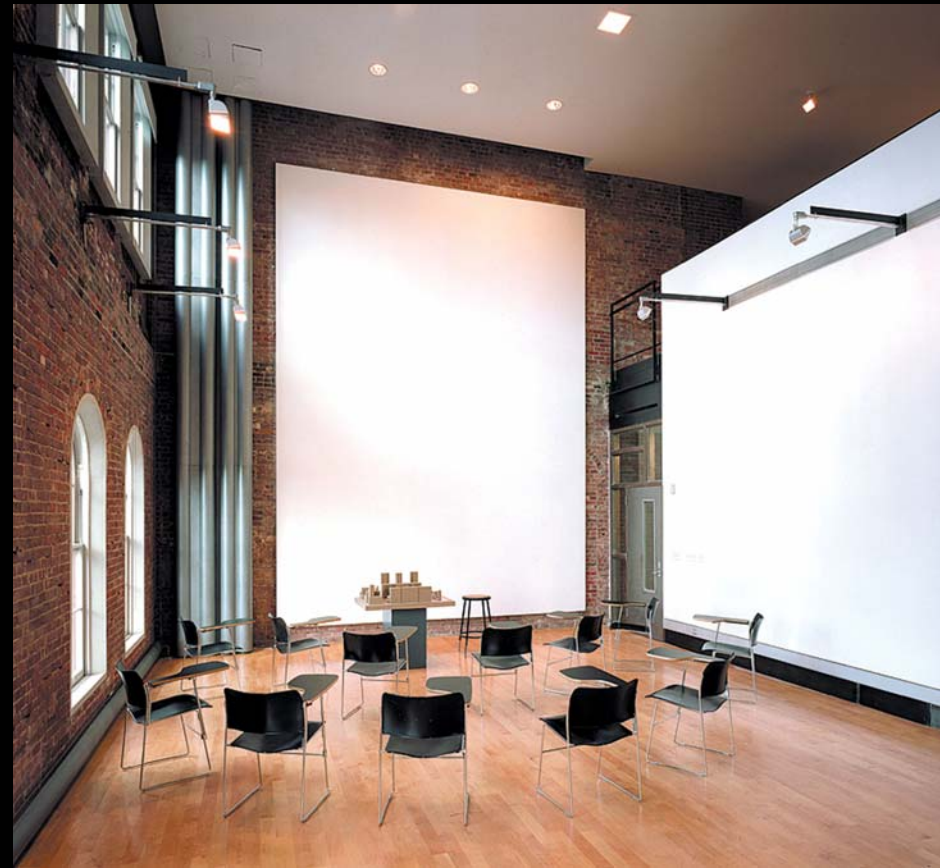
Similar material and spatial strategies throughout the building celebrate different eras of construction techniques, while creating a contemporary workspace for architecture. New student review spaces in the Central Wing (left) and North Wing (right) with balcony overlooks.