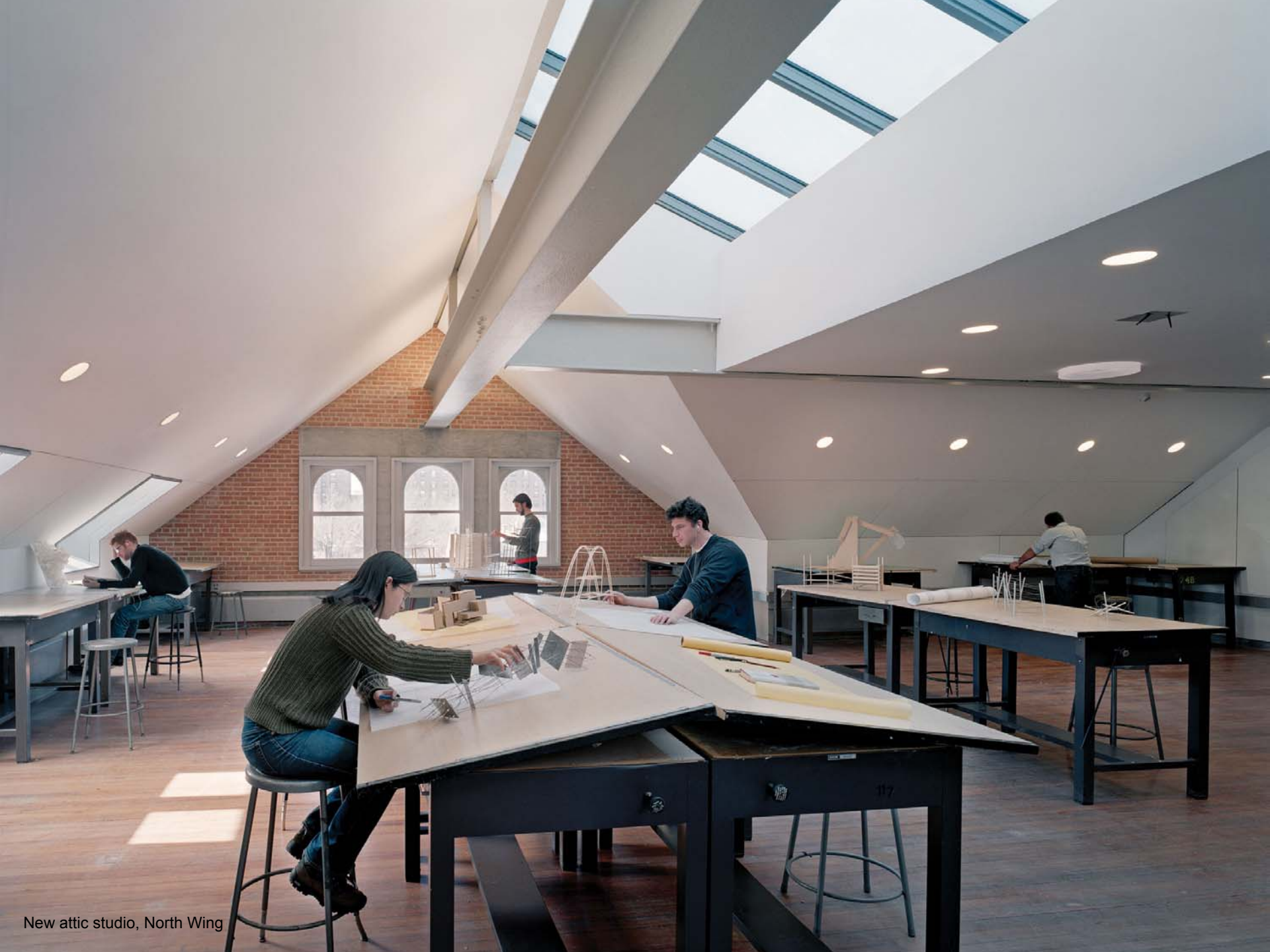
New attic studio, North Wing