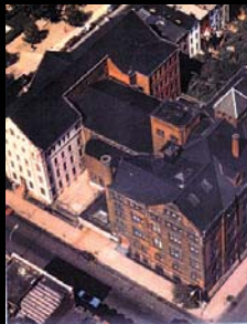
1965 Pratt acquires the complex; it is renamed Higgins Hall