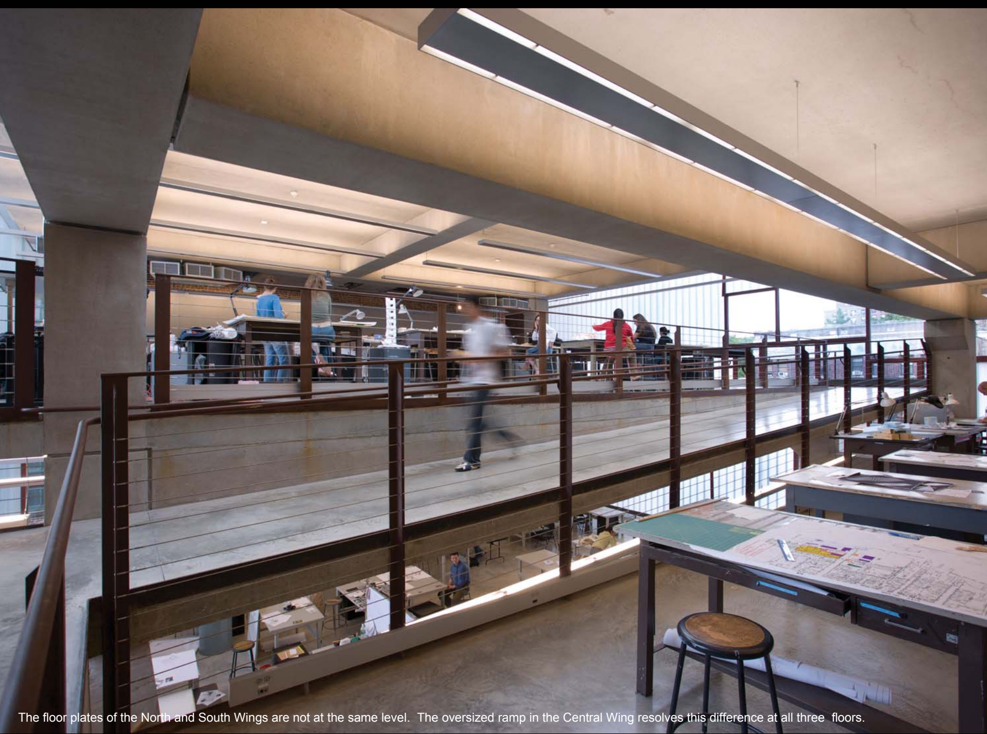
The floor plates of the North and South Wings are not at the same level. The oversized ramp in the Central Wing resolves this difference at all three floors.