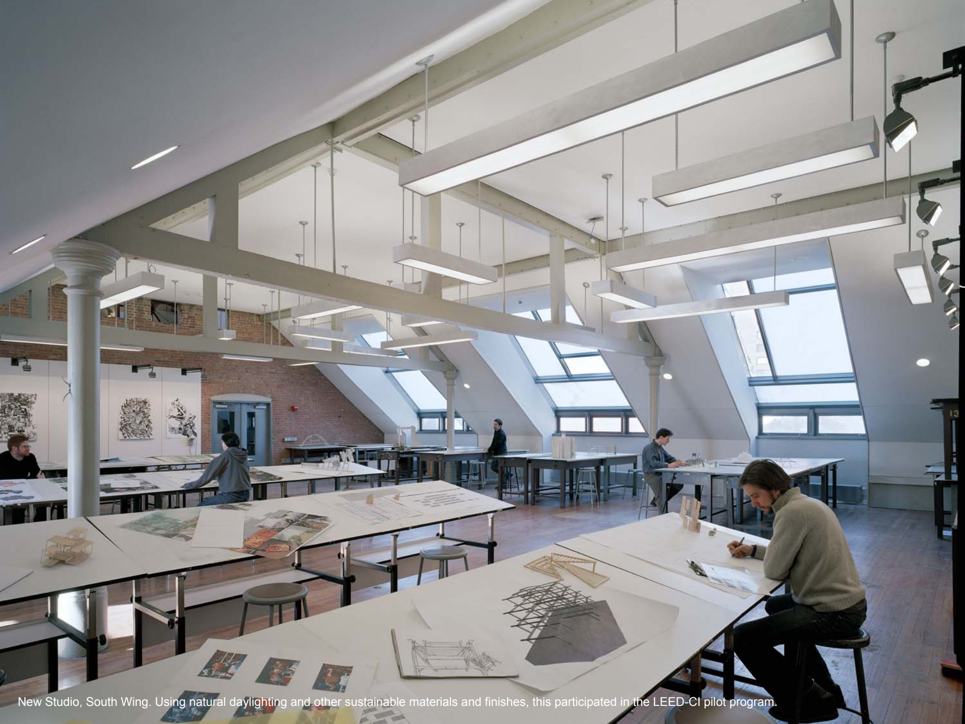
New Studio, South Wing. Using natural daylighting and other sustainable materials and finishes, this participated in the LEED-CI pilot program.