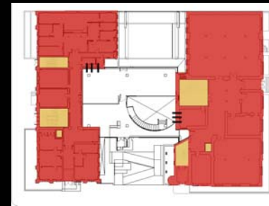
2003 South Wing completed Utility and circulation cores constructed in North and South Wings to serve later Central Wing;