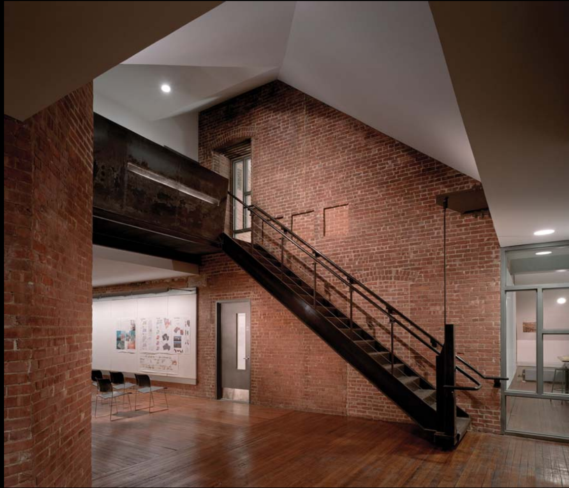
All spaces are treated in dynamic ways. Central Wing basement hallway, left; South Wing stairway with balcony overlook and “crit” space, right.